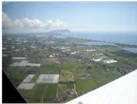
Inbound Terracina 1500 feet