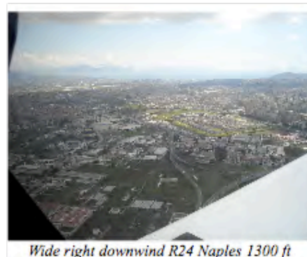
Wide right downwind R24 Naples 1300 ft