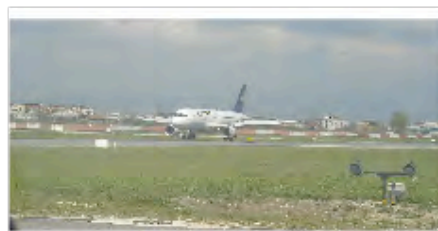
Commercial Airline landing straight after us!