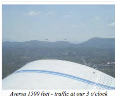
Aversa 1500 feet - traffic at our 3 o'clock