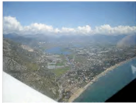
Approaching Fondi at 1500 feet